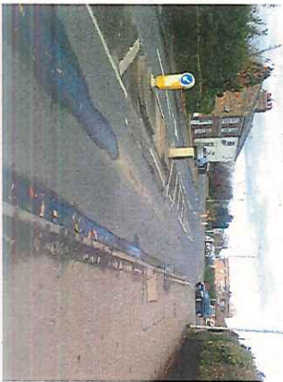
Looking West - Existing Ped. Refuge further east