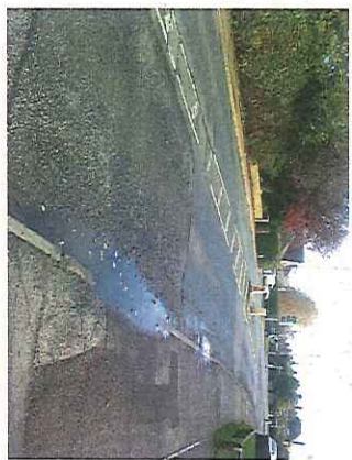
Existing lining and traffic island to the east