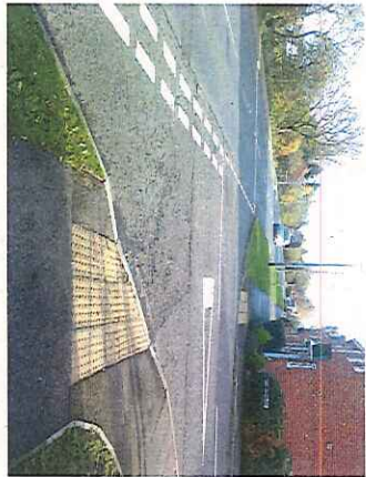
Junction with Poppyfields.