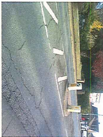
Traffic island in proximity to Garage