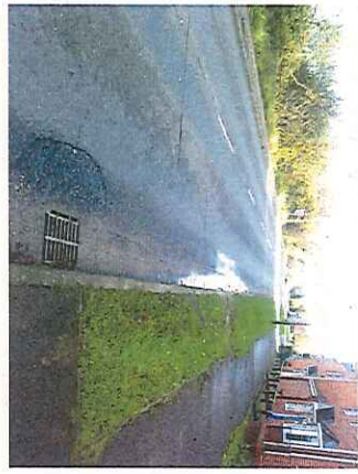
Facing east as you enter West Lynn.