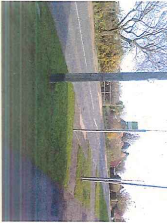
Existing bus stop infrastructure – Note streetlighting and utilities.